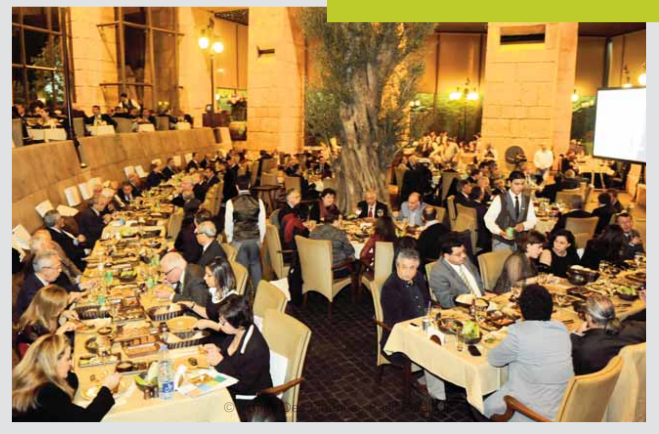
This document was downloaded from the website of Institut Des Finances Basil Fuleihan